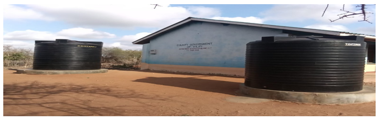
The two other tanks.

The above are other two tanks donated by the CHEPS organization. These are constructed adjacent to the only permanent building of the school. They do not have gutters for water harvesting in times of rains.