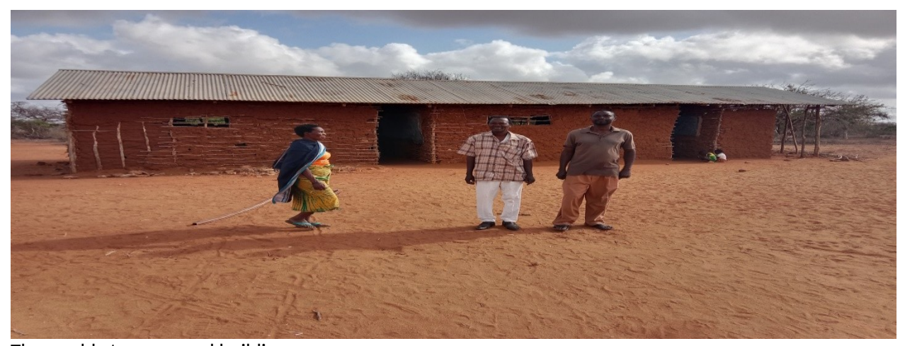
The muddy two roomed building.

There is also a two roomed muddy temporary building constructed by the parents. This one hosts grade 1 (one) learners in one and the second room is being used by the grade 2 (two) students.