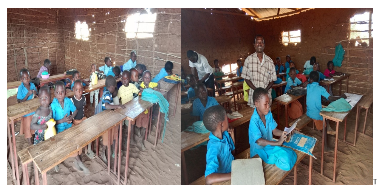
he Grade One Learners in class